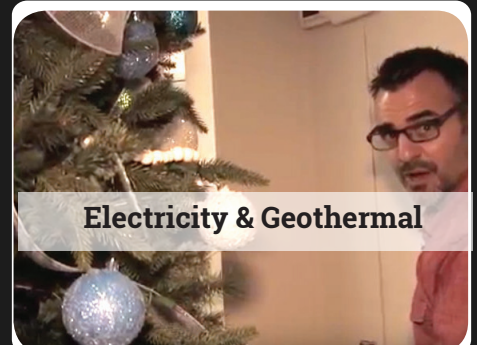
Electricity & Geothermal