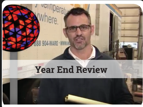
Year End Review