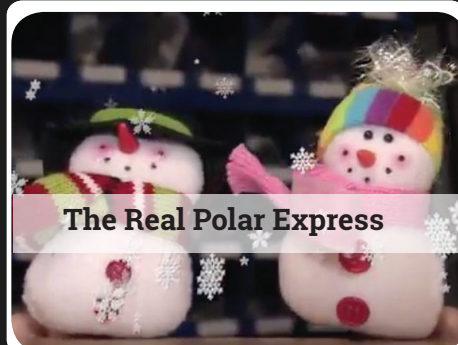
The Real Polar Express