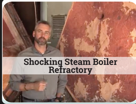
Shocking Steam Boiler Refractory